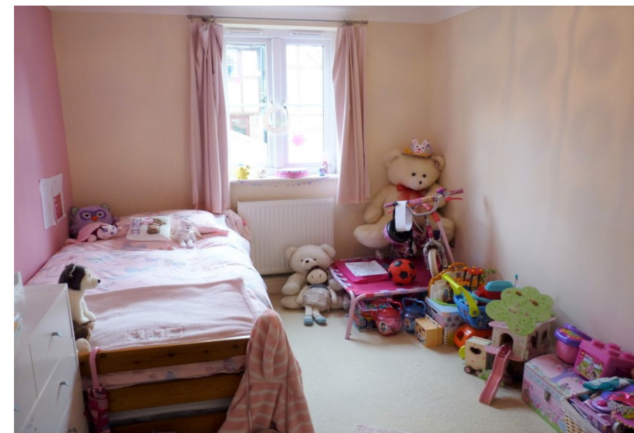
BEDROOM 2 14'7" x 8'5" Double room with window to the side.