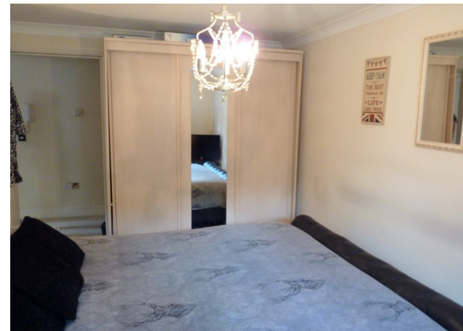
BEDROOM 1 14'4" x 9'2" Double room with built-in single wardrobe and space for freestanding wardrobe.